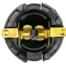
2 per package